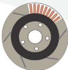
Neej Brake Disc

Neej Auto is one of the best selling brake discs and drums in India. We offer a wide range of products with best quality in design and performance to ensure to your safety. As established in 2008, we have fully equipped infrastructure with modern facilities and Highly technical laboratories. Neej auto prides itself on its product quality, wide range, excellent service and its rapid development of parts required for newly introduced vehicle models.